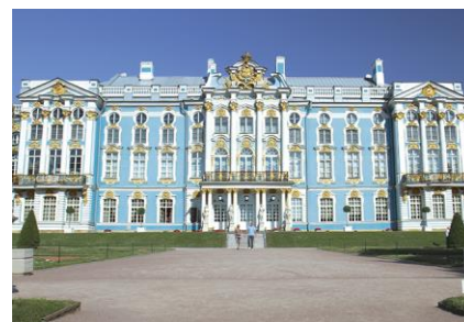
ST. PETERSBURG, RUSSIA

Extend your trip with two additional days in Russia's capital city. You will enjoy a guided tour through the city's famed subways and have free time to explore museums and the local culture. See the country's national treasures at The Armoury or delight in a meal at the Pushkin Café, located inside a baroque mansion. Two nights at the Radisson Royal Hotel (or similar), with daily breakfasts and hotel/ship transfers are included along with the services of a Viking host.