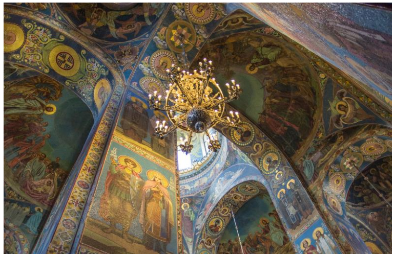
ST. PETERSBURG, RUSSIA